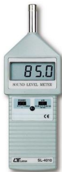
Figure 2. Sound level meter (SL- 4010).