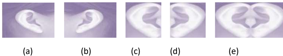
Figure 5 Proposed system (a) Right ear (b) Left ear (c) Right ear after normalization (d) Left ear after normalization (e) Merge ears to be proposed image (Mu, 2007)

Our proposed framework consists of three processes. The first of these is image acquisition process where we will utilize the IIT and USTB databases. The second process is designed to detect ear images from side profile face and applied skin segmentation and to calculate the edge map of the skin to create a suitable size of ear template. Ear localization from side face images will be done using Distance Transform and Template Matching followed by segmentation process to remove unwanted objects such as hat, hair or glasses frame from the image. The technique focuses on skin or non-skin segmentation, where the colour images will be converted to gray scale images in skin-likelihood image. Edge map of skin region will be computed and Canny edge detector is used to remove all edges that do not belong to the ear. Zernike moments are then applied to ensure this process (Surya Prakash, 2008). In this case we will take the ear image from various poses and angles, and we will apply on this image ASM to create a point-distributed model to normalize the ear image by calculating the longer axis from the outer contour. We will normalize ears for the longer axis to the same direction and length, then we will crop the ear with the border outer ear to get a pure image ear. Similarly for all previous stages we will detect the opposite ear to merge the left and right ear to create the proposed image (Figure 5 (e)).