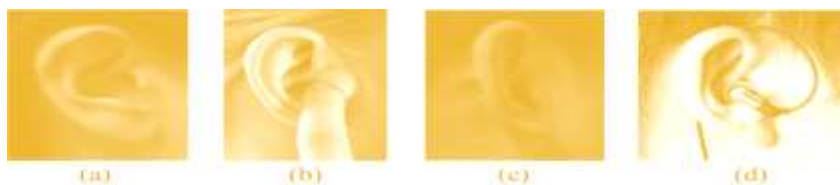
Figure 4 Examples of partial ear images (Chen & Mu, 2016)

Texture and Depth Scale Invariant Feature Transform (TDSIFT) descriptor was introduced by Chen et al. (2017) in their ear recognition method. They combined the 2D and 3D data, and encode the 2D and 3D local features for ear recognition. The method tested on UND J2 database and achieved a recognition rate of 95.9% with average execution time of 9.33 seconds.